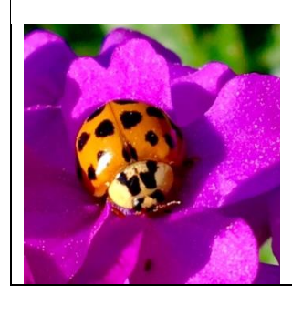
Asian Lady Beetle Often red, but orange or yellow possible; can have spots or not; black "M" on white pronotum (the top of the plate behind the head)