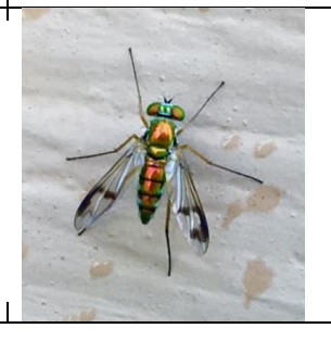
Long-legged flies Long legs and shiny bodies in various colors depending on the species