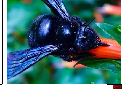
Strand's Carpenter Bee Thumb-sized; shiny black females with dark wings (shown here)